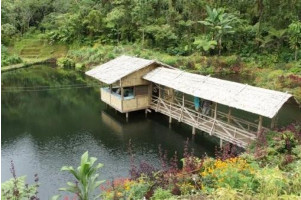
Wind house @ Manee Resources

On the 7th April I booked my comrades truck and we took off on a trip that was very interesting in the way the set up was done in the mountains of Kongara. It used to be the stronghold for the BRA during the height of the war.